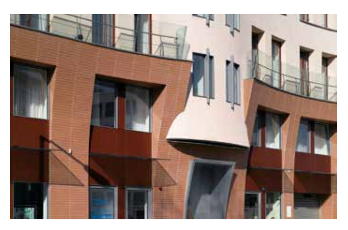
Hotel Messerschmitt, Bamberg, Germany Architect: Architectural office Seemüller, Bamberg, Germany

Whether modern new buildings, listed buildings or the extension of existing buildings - ceramic facade claddings do not only reflect the desired style and particular spirit of the time in a perfect manner, they also offer a great variety of formats, shapes, textures and colours for ventilated rainscreen facades. The carrier board of the StoVentec C system forms an excellent adhesion primer for ceramics and glazed brick slips. Besides ceramic coverings and StoDeco profiles and rustications, the carrier board is also suited for the application of glass (StoVentec G), glass mosaic (StoVentec M), render (StoVentec R) and natural stone panel tiles (StoVentec S).