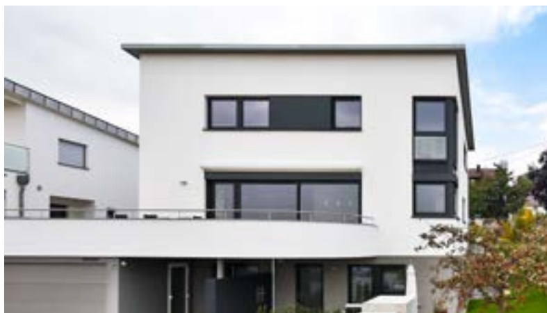
Image on right: Nürtingen clinics, DE Design: HSP Hoppe Sommer Planungs GmbH, Stuttgart, DE Execution: Anton Geiselhart GmbH & Co. KG, Pfullingen, DE Sto expertise: StoColor Sil In, StoColor Climasan

Image below: Detached house, Vaihingen, DE Design: Stecher architecture firm, Vaihingen, DE Execution: Hettich GmbH, Vaihingen, DE Sto expertise: StoColor Dryonic®, StoColor Supermatt